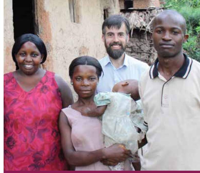
PRIMARY CARE RESEARCH IN ACTION

Stroke is the leading cause of disability in adulthood, the third leading cause of death and costs £9 billion per year in the UK. Reducing the risk of stroke is vital to improving the health of older people. We research 'funny turns' that are a warning sign of stroke (termed 'transient ischaemic attacks') and the detection and treatment of major risk factors for stroke – high blood pressure and atrial fibrillation.