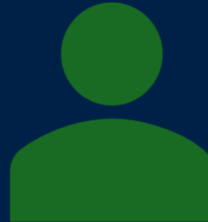
Senior leaders – NIHR Cappfinity