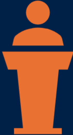
Emerging leadership – Ashridge