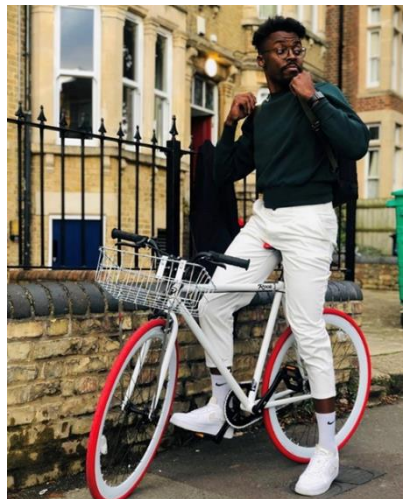
Student on a bicycle

Buses are another great way to get around. You can use Google Maps to plan your trips and get real time information about where the bus is. A single trip is a little over £2 and a return £3 - £4. If you plan to take the bus regularly, order a bus card and you can activate it and top it up with weekly, monthly and yearly bus passes online. Most (if not all) buses also accept contactless bank cards.