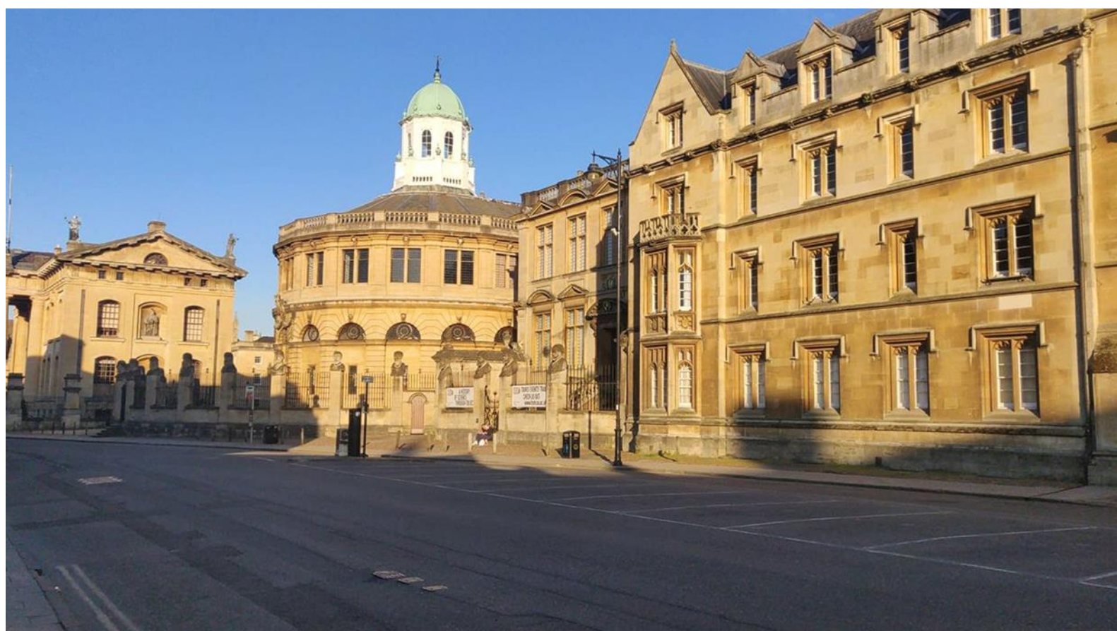
Broad Street, Oxford