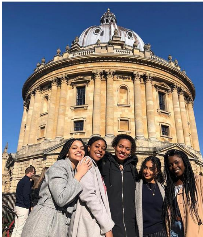
Students posing in front of the Radcliffe Camera