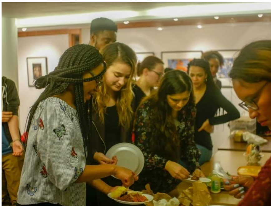
Students enjoying a potluck together