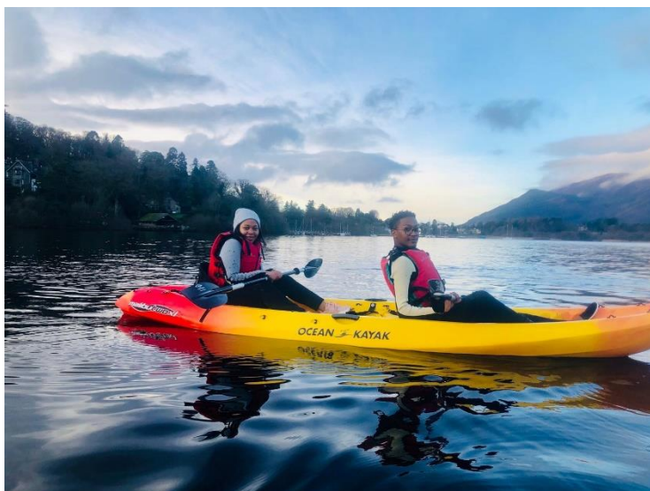
Students kayaking in the Lake District