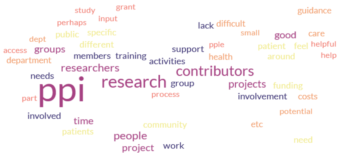
Figure 1. Word cloud created from responses at the PPI strategy development workshop