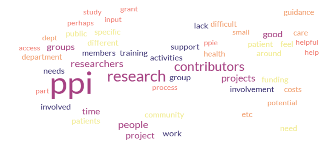
Figure 1. Word cloud created from responses at the PPI strategy development workshop

Plan and deliver at least one recognition event for public contributors.