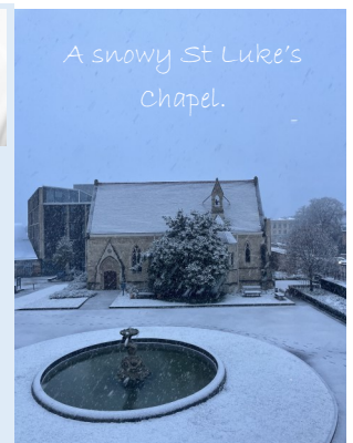
A snowy St Luke's Chapel.