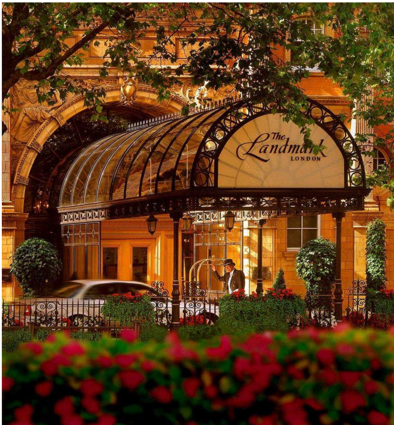
Front Exterior of the Landmark Hotel, London

We are delighted to welcome you to London. Your accommodation will be at the prestigious Landmark Hotel on the Marylebone Road in the heart of London. Accommodation will be in double rooms (single occupancy) with en-suite facilities and breakfast included for one person. All sessions will take place in the Drawing Room. Check in is from 3pm on Saturday 20 th September – check out by 10am on Sunday 21 st