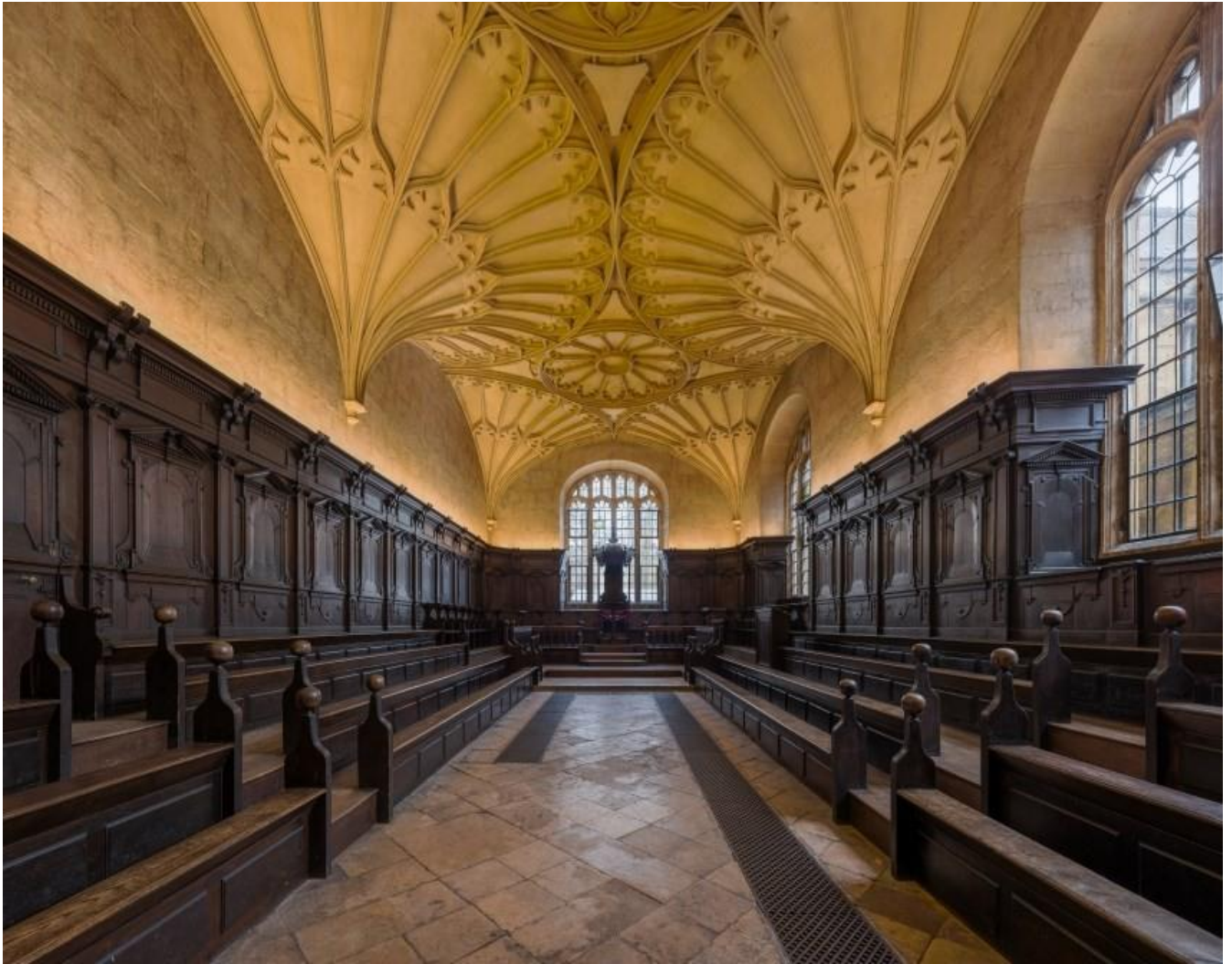
Convocation House Interior

Formerly a meeting chamber for the House of Commons during the English Civil War and later in the 1660s and 1680s.