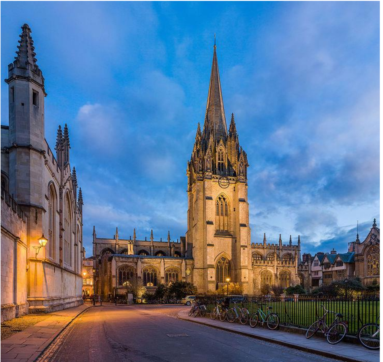
View of St Mary's University Church, Radcliffe Square, Oxford

Oxford is a diverse and historic city, just a short distance to the north-west of London. It is a major British and European Centre for the arts, science technology and innovation. For centuries, scholars, artists, writers. Scientists and film makers have found inspiration in Oxford's spectacular architecture; the city's famous 'dreaming spires'. Oxford's complex history and given rise to its unique character. It is also home to the University of Oxford, the oldest university in the English-speaking world.